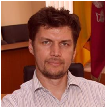
Włodzimierz Strelcow Pomeranian University in Słupsk, Poland